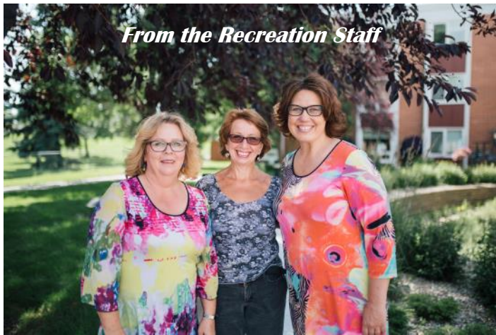
From the Recreation Staff