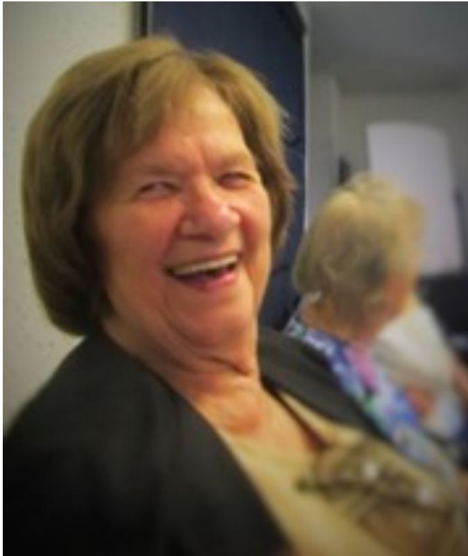
Residents benefit from the generosity of faithful donors