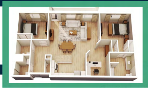
Two Bedroom Large