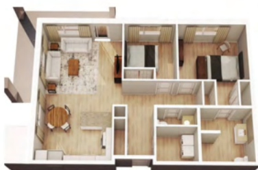
Two Bedroom Corner Balcony

As the structure of the building is almost complete and we move to the interior stage of construction, we are thankful for the progress that's been made to date. Many future residents have already signed up for their suite, and there are many more to come! We encourage you to reach out and arrange a time to sit down to go through your options, review the wide range of price points and services that will be available, and discuss how the Lighthouse might be a great option for you. Stay tuned for more updates on the construction progress!